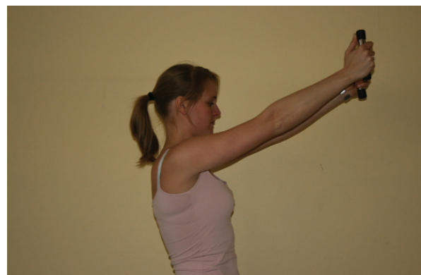
Figure 3. Forward flexion in standing position.

row (Figure 2), reached the criterion of category 2. The exercises forward flexion (Figure 3) and scaption with external rotation (Figure 4) were further selected within the 3 best exercises—however, with moderate accuracy (category 3).