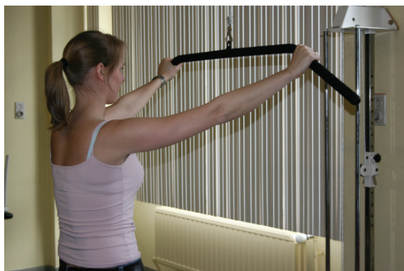
Figure 2. High row exercise.